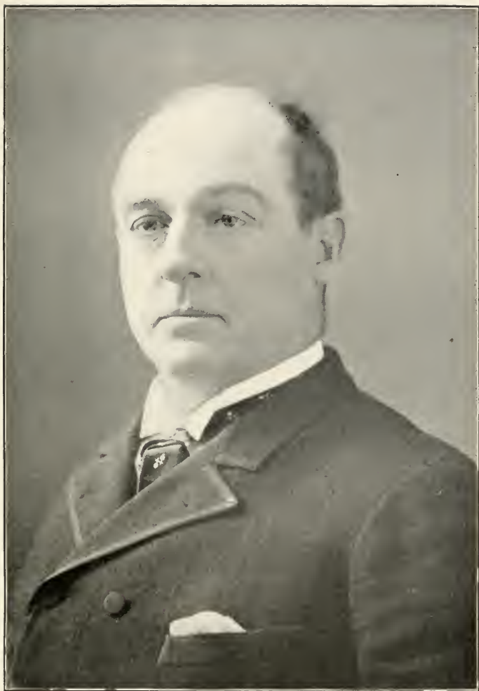
HON. CHARLES A. SHAW.