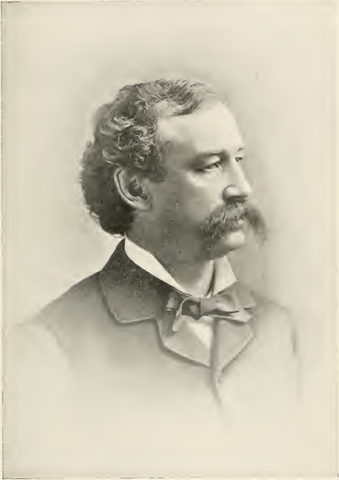
HON. SUMNER I. KIMBALL.