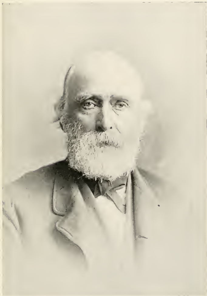
GENERAL EBENEZER RICKER.