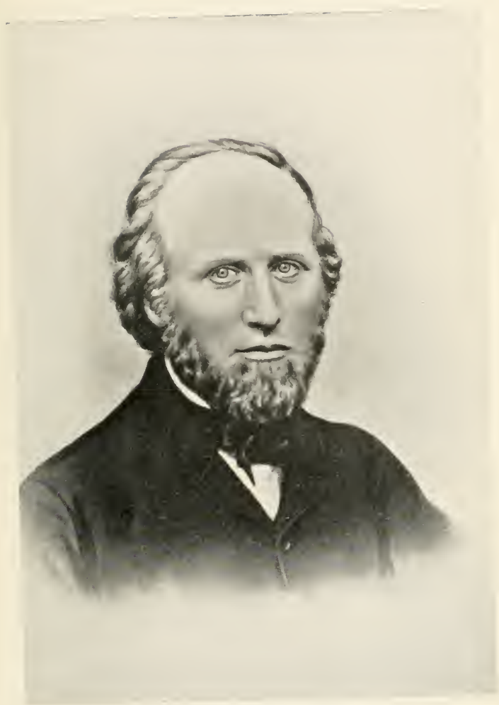
COLONEL EBENEZER NOWELL.